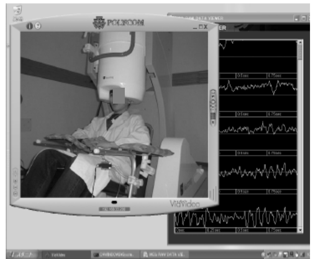
Figure 1. A Screen shot of the user interface in a remote site. The user interface visualizes a subject and MEG data.

MEG data were measured by a whole-head neuromagnetometer (Neuromag-122™, 122ch, 400 Hz A/D sampling, 32-bit quantized) in a magnetically shielded room at Kansai Center of AIST in Ikeda, Japan. The applicability of Grid computing to the analysis of brain function was evaluated by using it for wavelet cross-correlation analyses [Mizuno-Matsumoto, 2002] and Independent Component Analysis (ICA) [Kaishima, 2002] [Hyvarinen, 2001], both of which require relatively large amounts of computation. The analysis methods were parallelized because the wavelet cross-correlation analyses of the data in one MEG channel is independent of the processing of the data in any other channels. These methods were implemented into an experimental Grid environment composed of two PC clusters at the Cybermedia Center of Osaka University in Suita, Japan, and one PC cluster at Nanyang Technological University in Singapore. The Grid environment consisted of 60 PCs, and was developed by utilizing the Globus Toolkit. During measurements, MEG data were transferred via a 1-GB/s network in real-time from the MEG system to the Grid environment. In addition, a real-time video transfer system was developed to monitor the MEG activity at the MEG facility. Fig. 1 shows a screen shot of these systems.